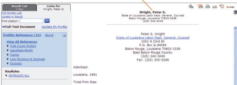
Figure 2. Profile of an attorney