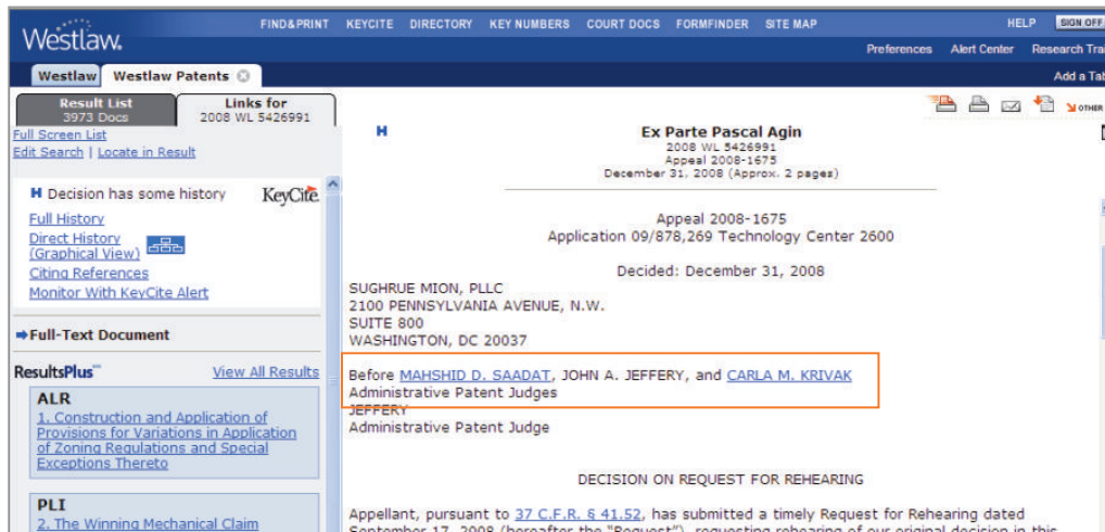
Figure 2. Links to profiles in displayed document

To access an individual's profile from a displayed document, click the name of the individual in the document. For example, while viewing a Board of Patent Appeals and Interferences decision, click the name of a judge to view that individual's profile (Figure 2).