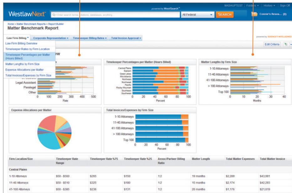
The easy-to-read overview not only tells you what is going on with the data, it shows you with insightful graphics.

No other online research service integrates firm performance in one display on the overview.